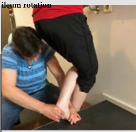
Fig. 8 Day 3 Training forefoot stability and explosive strength of the plantar flexors

Fig. 5 Day 2 Relief of the SI joint and lumbar spine by promoting dorsal