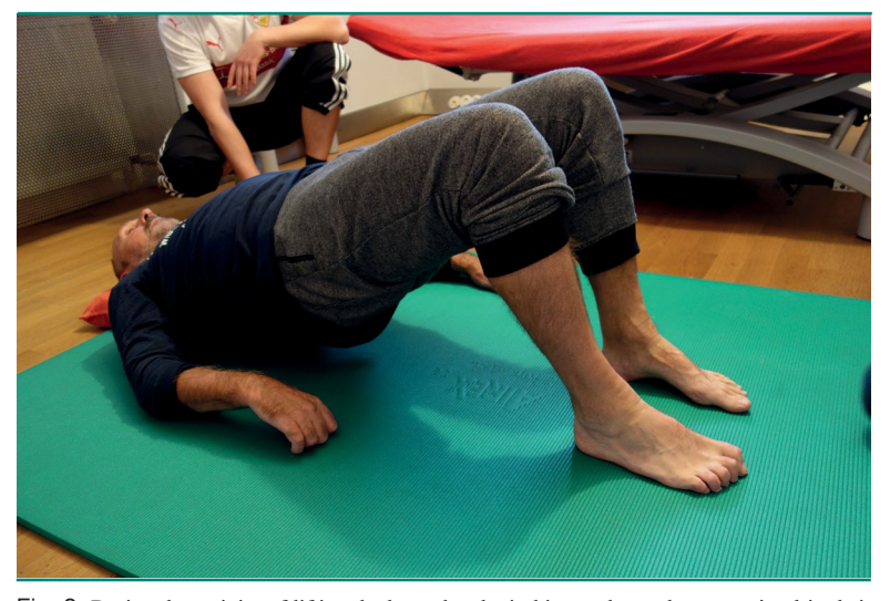
Fig. 2: During the activity of lifting the buttocks, the ischiocrural muscles are trained in their maximum approximation. The stable forefoot must be ensured by the function of the Mm. peronaeii