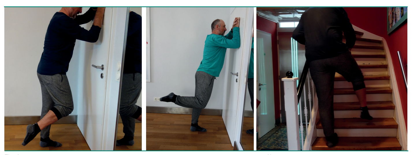
Fig. 3a: Before therapy, Mr. S. is unable to flex his knee against gravity up to 90° and deflects with his hip; 3b: After three therapy sessions, he is able to flex his knee 90° against gravity with a stable hip; 3c: When climbing stairs, he does not use the potentials at body structure and function level